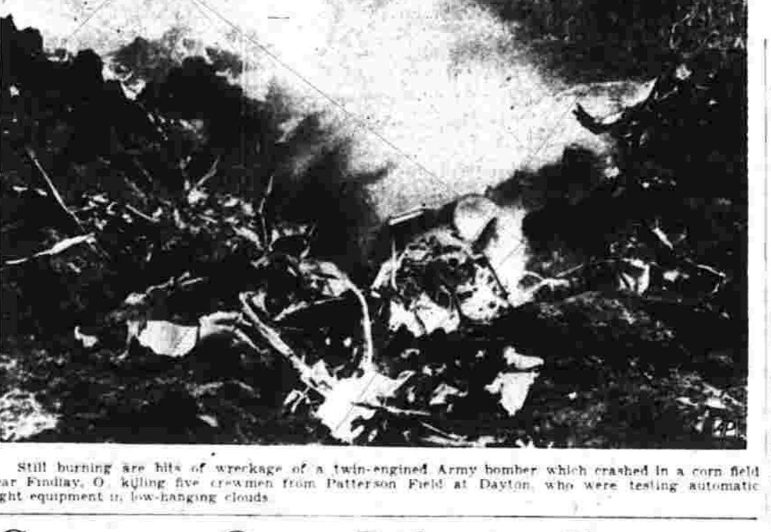
Still burning are bits of wreckage of a twin-engine Army bomber which crashed in a corn field near Franklin, O. Killing five crewmen from Patterson Field at Dayton, who were testing automatic flight equipment in low-flying clouds.